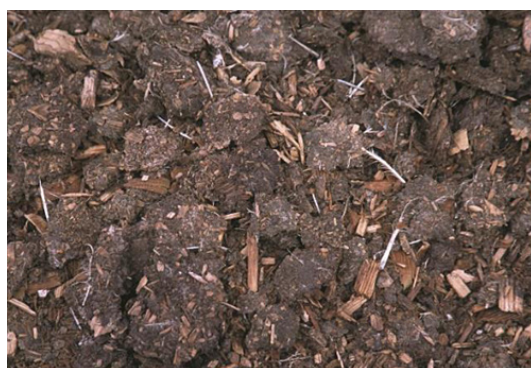
Fig. 6: Composted animal manure

should be spread in thin layers for better result across perennial and vegetable beds and concave at the end of the growing season. Before adding extra layers let every layer to dry. Grass clippings will mat if thick layer of clipping is applied instead of thin layers. Grass clippings taken from lawns which is treated with insecticides or herbicides never be used. It should apply at a depth of 2 to 3 inches (Ranjan et al. , 2017)