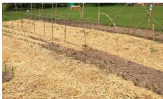
Fig. 8: Straw mulching

and black newspapers (Patil et al. , 2013). Apply 2 to 3 layers of newspaper at a time and cover it with leaf mulch or grass clippings or any other organic materials so that it cannot blow away by the winds. Newsprint will ultimately decay and can be merged into the soil.