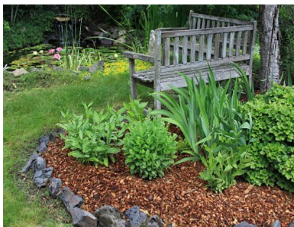
Fig. 2: Bark clipping mulching

Organic mulches comprise of materials like animal compost, grass clippings, straw of various crops, dried leaves, tree bark clippings and saw dust. It has easily degradable capacity because nature of appealing slugs, insects and worms that eat them and help them in rapid degradation, which results in addition of some quantity of nutrient and organic material in the soil. Organic mulch has a large number of helpful features. Some of them are: soil moisture conservation by reducing the rate of evaporation, moderates soil temperature, lessens soil erosion, hinders growth of weed, cheers the growth of beneficial soil bio-organisms, and diminishes the blowout of soil-borne pathogens. Organic mulches after decomposition over time improve soil structure and increase nutrient content of the soil (Telkar et al. , 2017). The illustration of different organic mulches and their usages are given below: