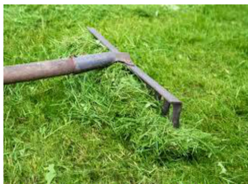
Fig. 5: Grass clippings

speed, should be used to lessen these problems (Patil et al. , 2013). It can be made at home by composting shredded leaves. Leaf mulch (shown in Fig 4) can be used in all types of gardens. Leaves infected with disease should be disposed instead of composting (Telkar et al. , 2017). Proper thickness of the leaf mulching is about 3 to 4 inches (Ranjan et al. , 2017).