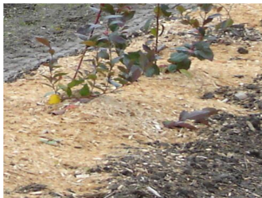
Fig. 9: Sawdust mulching

content is less in straw but soil converts more productive after decomposition of straw mulches. Straw mulches (shown in Fig 8) reduce amount and rate of evaporation and lessen the amount of energy captivated by the soil (Telkar et al. , 2017).