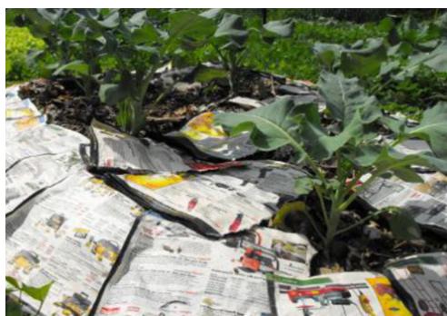
Fig. 7: Newspaper mulching

into burning of plant roots. Before using as a mulch manure should be well decomposed at temperatures between 54°C to 60°C for minimum one week and 4 to 6 months composting to eradicate potential disease micro-organisms. The manure of pigs, cats and dogs should never be added to vegetable crop. It is too used as a mulching material in various nutrient consuming florae alike roses. 3-4 inches of depth is favorable for compost using as a mulch (Ranjan et al. , 2017).