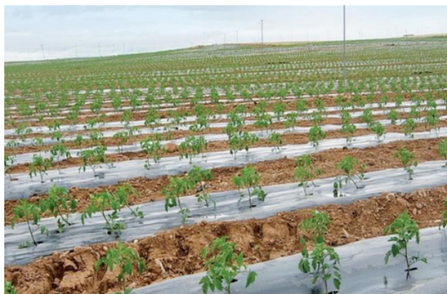
Fig. 17: Plastic mulching in tomato