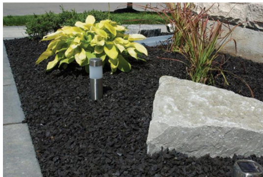
Fig. 12: Rubber mulching

cost effective and discourages insects and pests development.