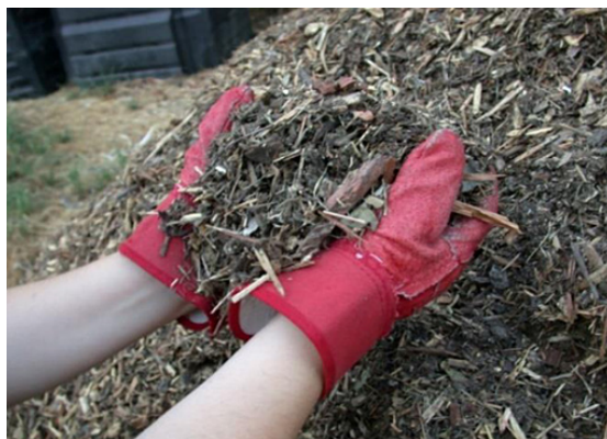
Fig. 3: Tree wastes

It is similarly a derivative of wood and paper industries. The common example is pine bark and it is commonly used under large shrubs and trees. It is somewhat acidic in behavior, takes more time to decay. These barks are obtainable in several sizes and generally applied to 2 to 4 inches of depth (Ranjan et al. , 2017).