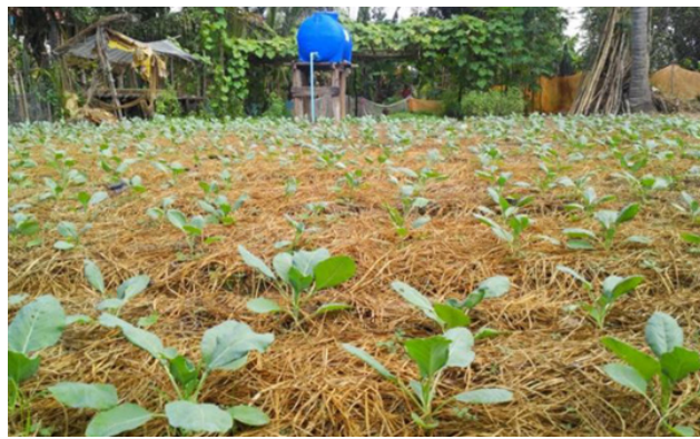
Fig. 16: Straw mulching in vegetable (Source : https://horticulture.ucdavis.edu/ )

(Source: NCPAH, New Delhi (National Committee on Plasticulture Applications in Horticulture))