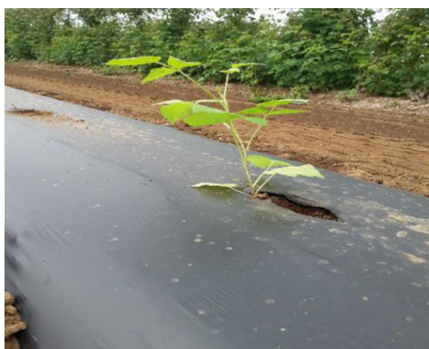
Fig. 15 Biodegradable plastic mulch

soil bed after getting filtered from the colored films. These films are effective in controlling of weeds and increasing the temperature of soil.