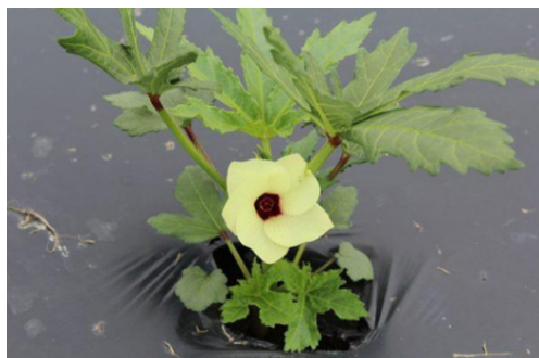
Fig. 17: Plastic mulching in tomato