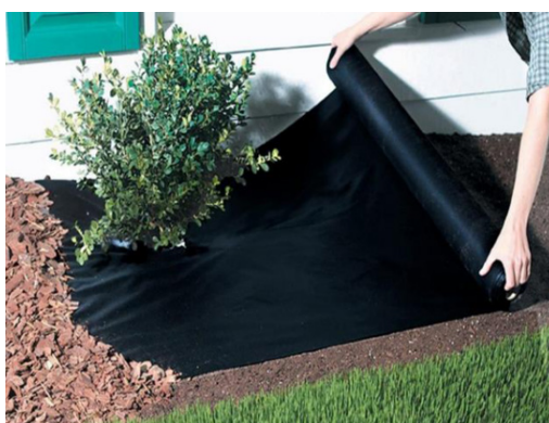
Fig. 10: Landscape fabric

and air to pass through it. It can also crumble more quickly than most of the other inorganic mulches when it is used in combination with organic mulches. Landscape fabric is generally made up of polypropylene web of high strength and it acts as a stretchy open-weave textile. It can also control the soil erosion and protect the soil from wind and water erosion, when it is used beneath a layer of mulch. It allows drainage of rain water through it into the soil, which is not possible in plastic films. Landscape fabric is more preferable than plastic films most of the time.