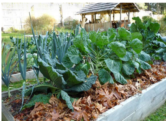
Fig. 4: Leaf Mulching

larger sums of nitrogen inside the soil. This type of mulch is specifically useful for making pathways (Telkar et al. , 2017).