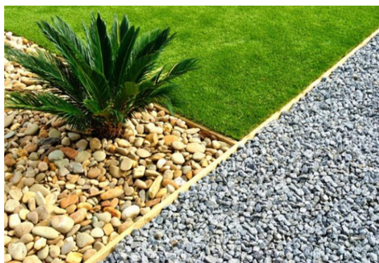
Fig. 11: Stone mulching

solar radiation is echoed by stones, that can create very hot soil atmosphere during hot season. So, it should be used away from trees and other plants.