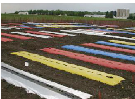
Fig.14: Colored mulch film

It delivers extra light to the plant and reflect a range of light which can partially discourage the white flies and aphids to spread disease.