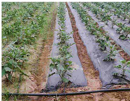
Fig. 13: Plastic mulching

sunlight. In plastic mulching, both types of colored and clear or transparent films are used. Plastic mulches like biodegradable and photodegradable mulches comprises of optical properties which is used for definite crop in a specified location (Steinmetz et al. , 2016). It should be used for specific crop after understanding the optimum environment around the ground.